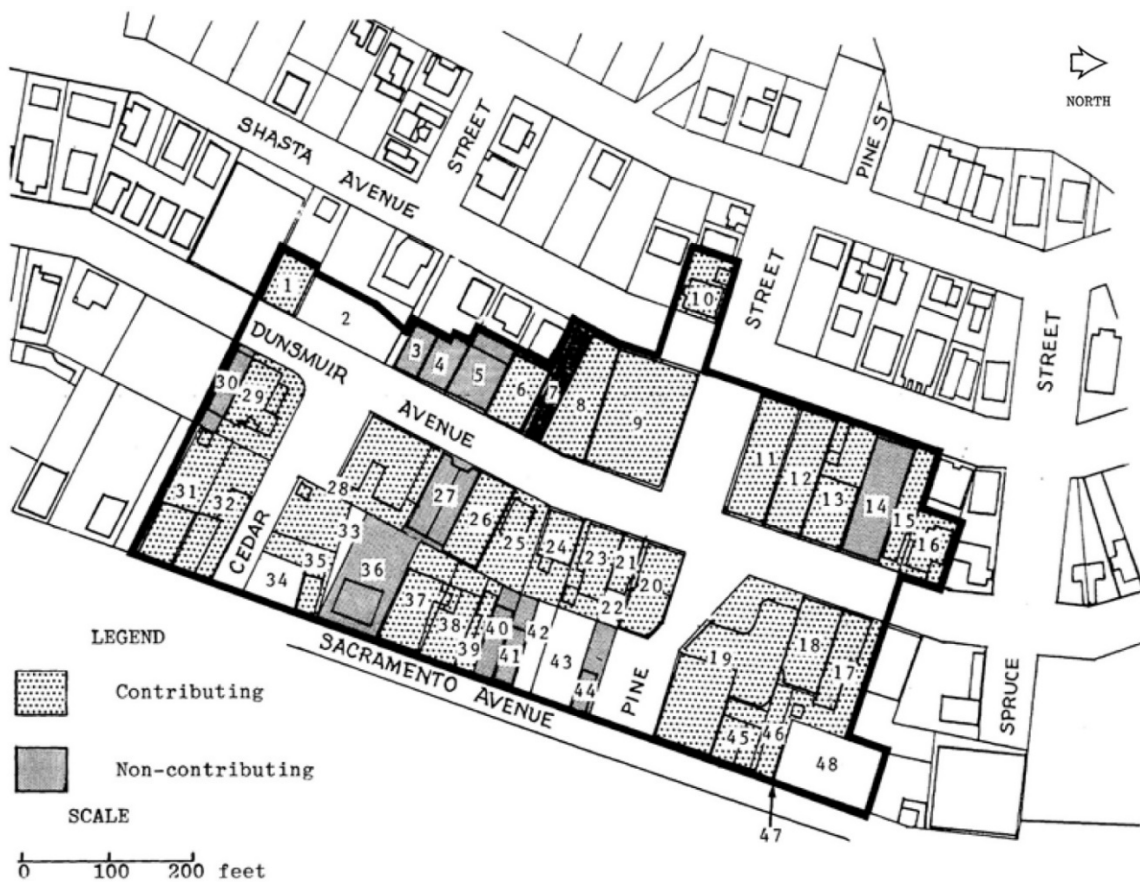
Figure 17.68-1, Dunsmuir Historic Commercial District