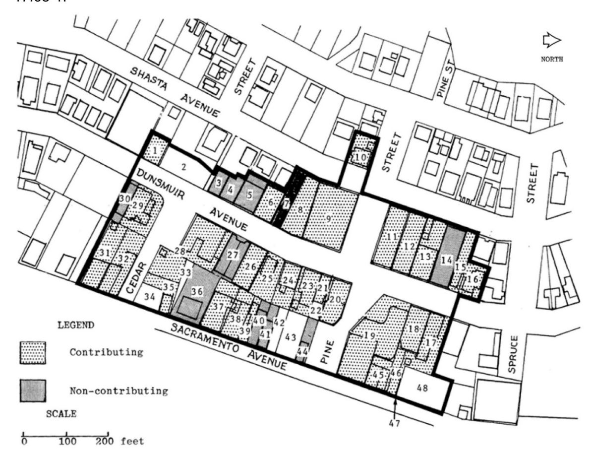
Figure 17.68-1, Dunsmuir Historic Commercial District

A. Dunsmuir Historic Commercial District. There is hereby designated pursuant to the provisions of this chapter, a historic district known as the "Dunsmuir Historic Commercial District." Said district is a composite of approximately four blocks that comprise the historic commercial core of the city, and which are roughly bounded by Sacramento Avenue, Dunsmuir Avenue, Pine Street, and Cedar Street. The "Dunsmuir Historic Commercial District," and the contributing and non-contributing resources within it, are shown in Figure 17.68-1.